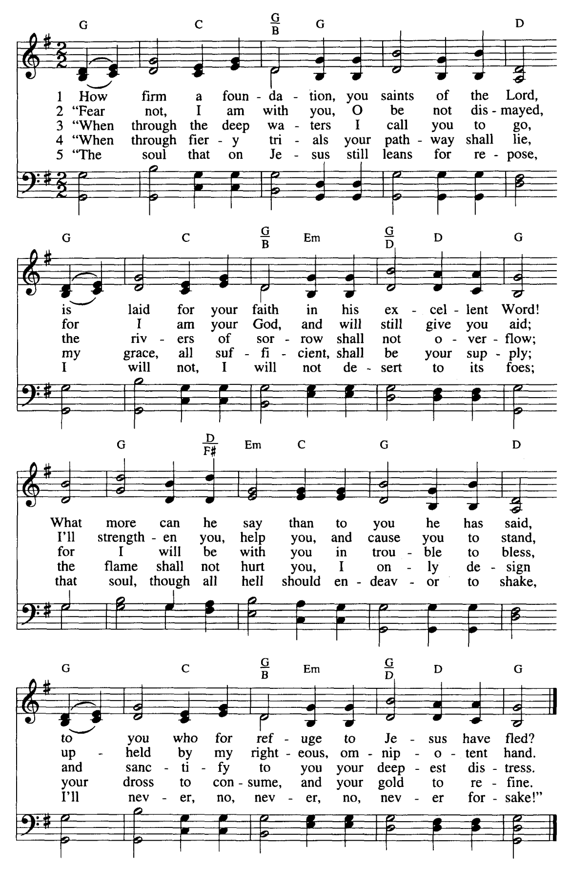
Words: Rippon's Selection of Hymns , 1787, alt. (vv. 2–5 para. Isaiah 43:1–5). Music: FOUNDATION, Funk's Genuine Church Music , 1832. Public Domain.