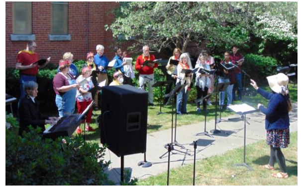
The choir braved the blustery weather on June 4 at our outdoor worship & 10th anniversary celebration!

The United Ringers handbell choir meets immediately following worship on Sundays from 11:30am to 12:30pm in the sanctuary. Our handbell choir plays 2-4 octaves of Malmark handbells and handchimes, providing music for worship about once a month. The first rehearsal for the bell season is on